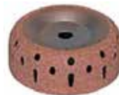
51-256 / 16 gr 51-257 / 36 gr 51-258 / 60 gr