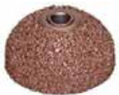
51-241 / 16 gr 51-242 / 36 gr 51-220 / 60 gr