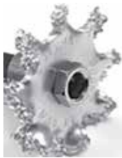
51-208 / 36 gr 51-209 / 16 gr

OUR COPPER BUFFOUT TOOLS – IMPROVED ROUND FACED DESIGN YOU WILL HAVE A CONSISTENT, HIGH PERFORMANCE TOOL EVERY TIME. BOX OF 10 AH 3/8" x 24 THREAD. YOU WILL HAVE A CONSISTENT, HIGH PERFORMANCE TOOL EVERY TIME.