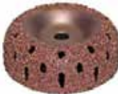
51-246 / 16 gr 51-247 / 36 gr 51-248 / 60 gr