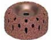
51-251 / 16 gr 51-252 / 36 gr 51-253 / 60 gr