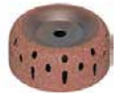
51-261 / 16 gr 51-262 / 36 gr 51-263 / 60 gr